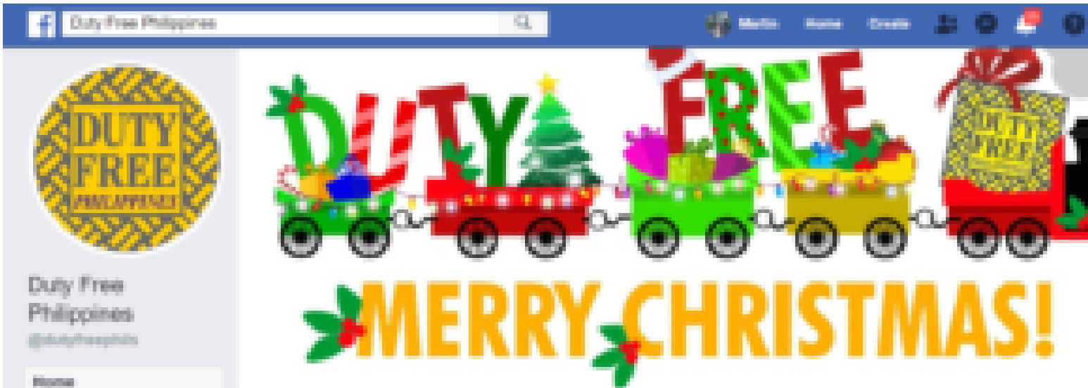
Festive facebook wishes from Duty Free Philippines